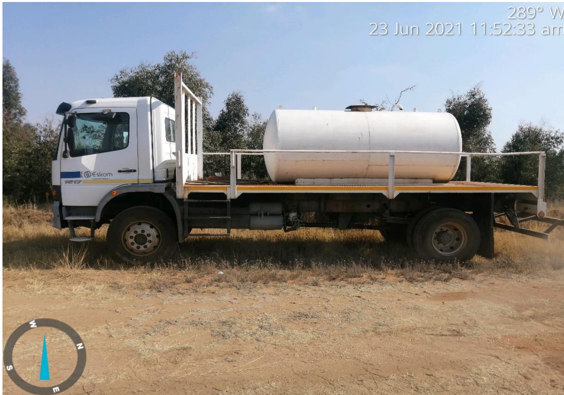
Figure 4: Water cart observed on site.