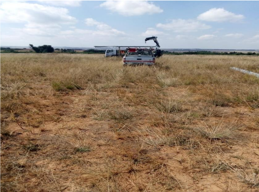
Figure 1: Construction area