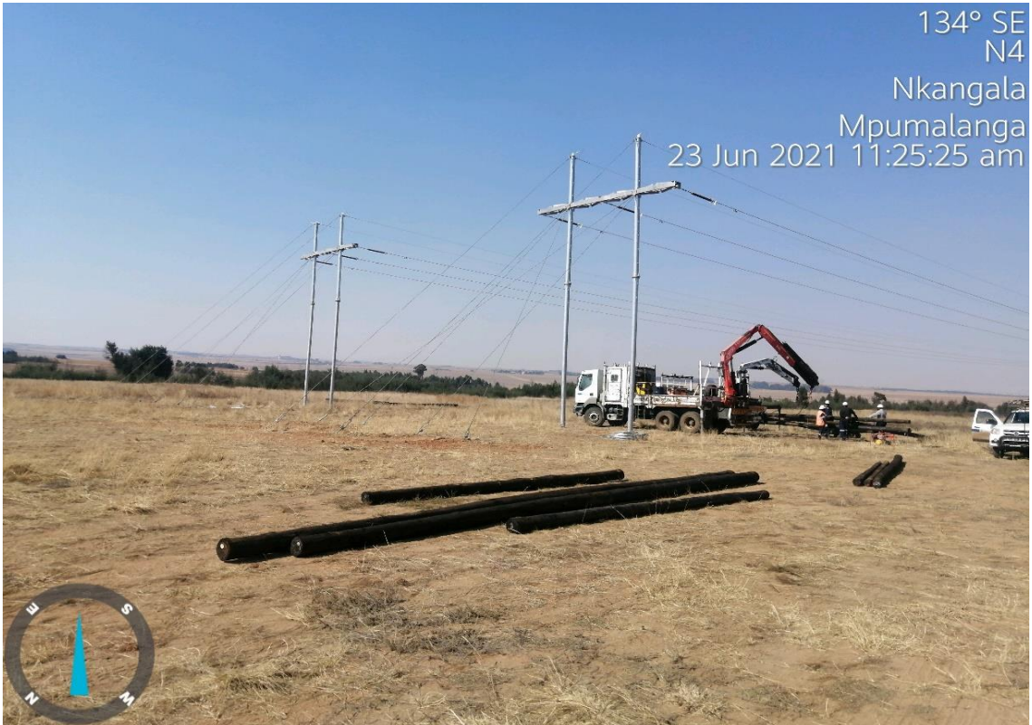
Figure 2: Activity on the day of the audit.