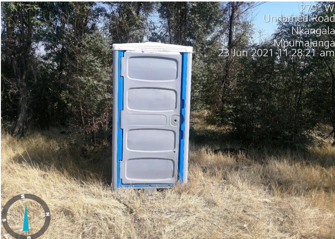
Figure 1: Ablution available on site.