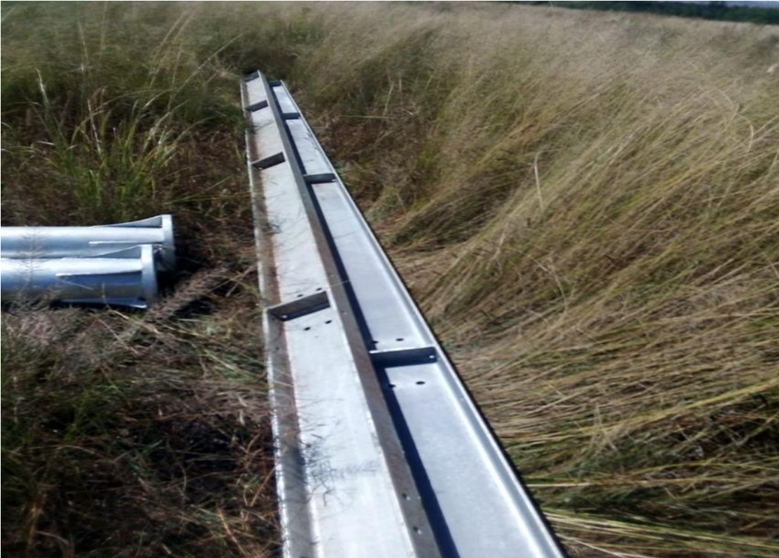
Figure 3: Poles for Power Line (31 st March 2021)