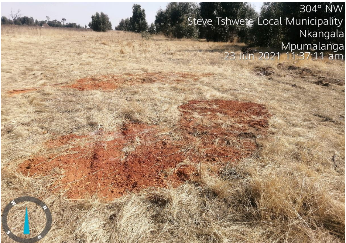
Figure 3: Excavations have been back filled.