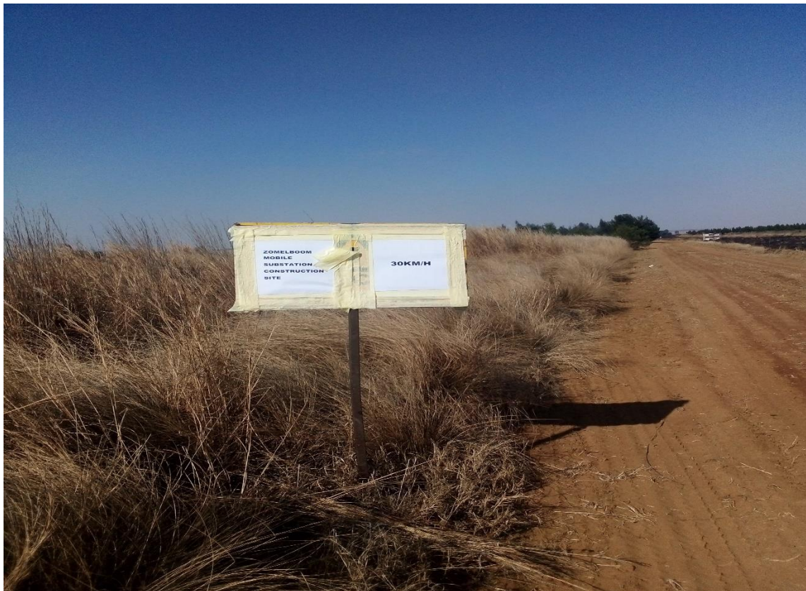
Figure 5: Construction Notice Sign on Site