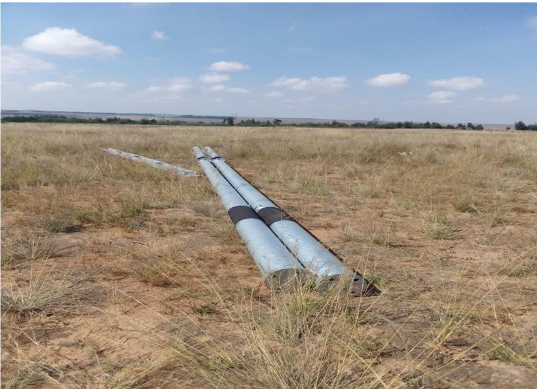
Figure 2: Works in Progress